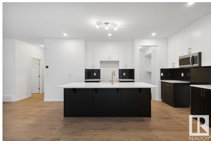
37484026 – Interior Selection Photo – Main Floor

MLS® # E4428135 Price $647,990 Bedrooms 4