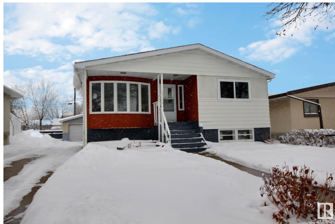
12136 38 St NW, Edmonton, AB

MLS® # E4428099 Price $385,000 Bedrooms 5 Bathrooms 2.00