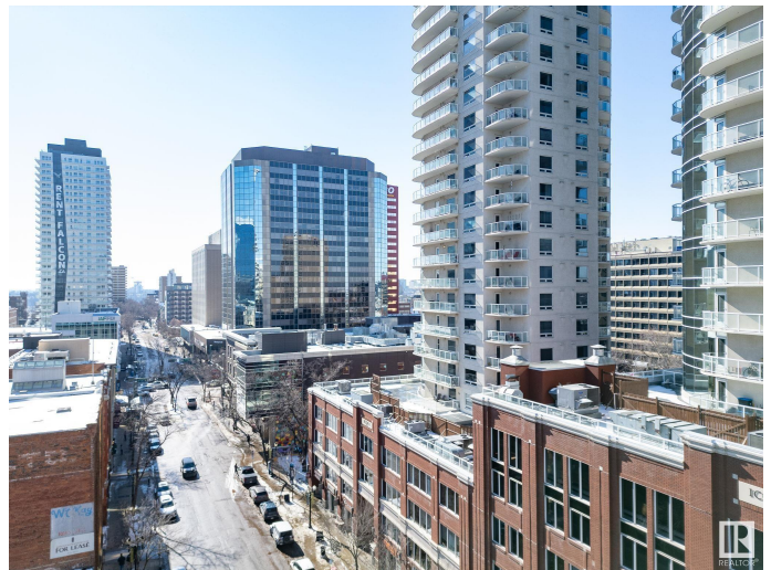
701-10136 104 Street NW, Edmonton, AB