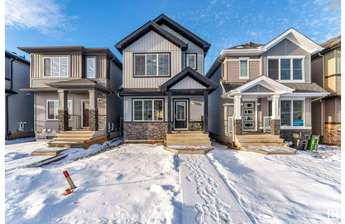
9574 Carson Bnd SW, Edmonton, AB

MLS® # E4416797 Price $485,000 Bedrooms 3 Bathrooms 2.50